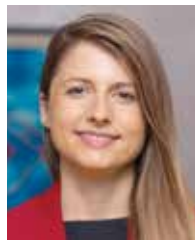
Hon. Tamara Srzentić, Minister of Public Administration, Digital Society, and Media