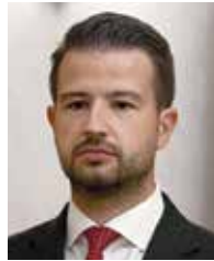
Hon. Jakov Milatović, Minister of Economic Development

Hon. Tamara Srzentić, Minister of Public Administration, Digital Society, and Media: Our ministry is entrusted with the strategic approach of our society's digital transformation through the development of e-services for the citizens. In this strategic area, we are working to attract digital nomads to Montenegro, promote ICT investments, and enhance cyber security. Our core focus and mission are to improve how citizens interact with the government, to create a government by the people, for the people of the 21st century, and to simplify the government to make it better connected. The long-term goal is to have everything to be done digitally and to build a more transparent and open government. It has to do with the feeling and the trust. We want to create delightful experiences where our citizens will return their trust in the government through this digital lens.