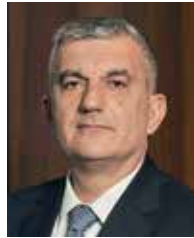
Hon. Mladen Bojanić, Minister of Capital Investments