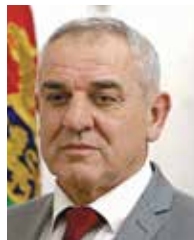
Hon. Ratko Mitrović, Minister of Ecology, Spatial Planning, and Urbanism

Hon. Mladen Bojanić, Minister of Capital Investments: Montenegro is an emerging country with huge investment and development potential. We have numerous opportunities in the transport, maritime, energy, and mining sectors. Montenegro is a touristic country and requires good connectivity inside and worldwide with all its neighboring countries. There is an opportunity for better air, road, railway, and also maritime infrastructure. We have planned to make the Port of Bar a modern port that can be used as a corridor to Belgrade, Bucharest, Budapest, and Eastern Europe. In the energy sector, efficiency is a priority; we have applied to the Paris Agreement and have started the green transition to develop renewable resources and eliminate pollution. Montenegro has great potential for solar, wind, and hydropower development. We have natural opportunities; if we take them, we will have affordable resources to invest in and many investors can come and improve our energy production.