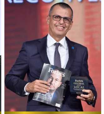
Mazin Khoury , CEO, Middle East & North Africa at American Express Middle East